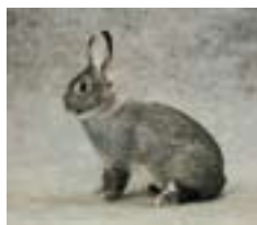
32. Cincilla piccolo