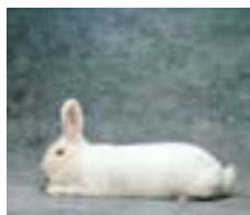
11. Bianca di Nuova Zelanda