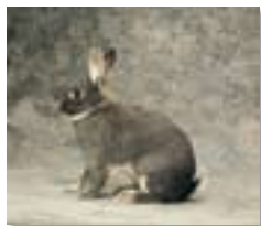
26. Fata perlata