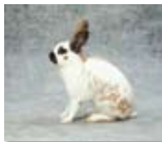
27. Pezzata inglese