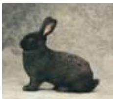
12. Argentata grande