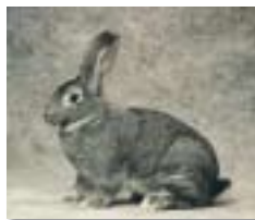
06. Cincilla grande