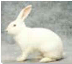
02. Gigante bianco