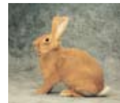
09. Fulva di Borgogna