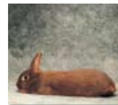
14. Rossa della nuova Zelanda