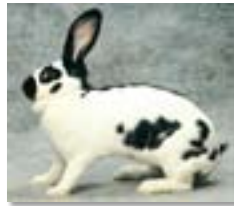
03. Gigante pezzato