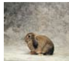
35. Ariete nano