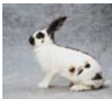
17. Pezzata tricolore