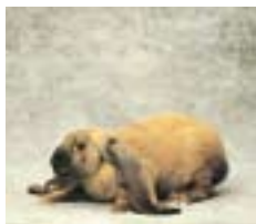
07. Ariete inglese