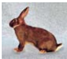
43. Leprino di Viterbo