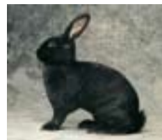
08. Blu di Vienna