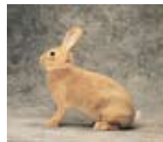
29. Argentata piccola