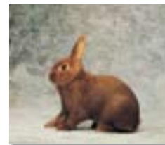
25. Oro di Sassonia