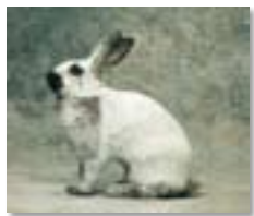
05. Argentata di Champagne