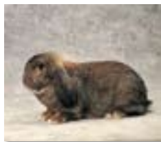
22. Ariete piccolo