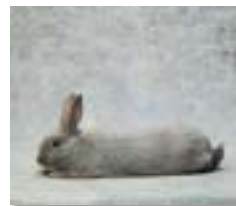
24. Fata di Marburgo