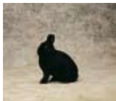
37. Nani colorati