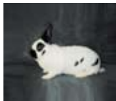
42. Pezzata piccola